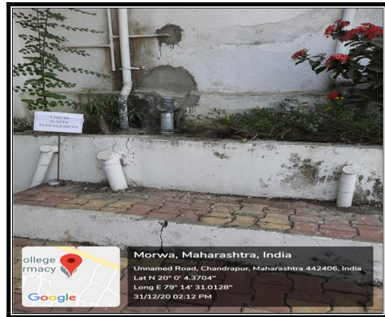
Liquid Waste management