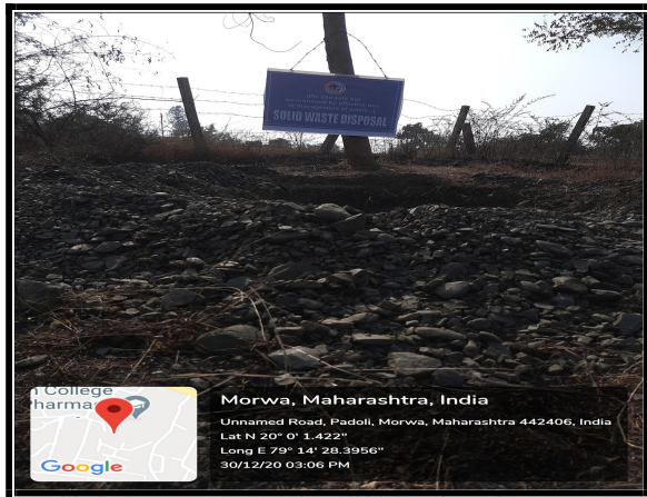
Solid Waste management